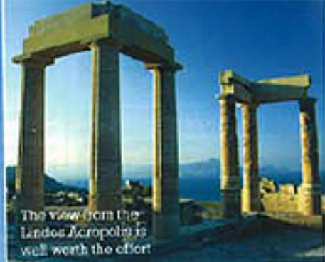
The view from the Lindos Acropolis is well worth the effort