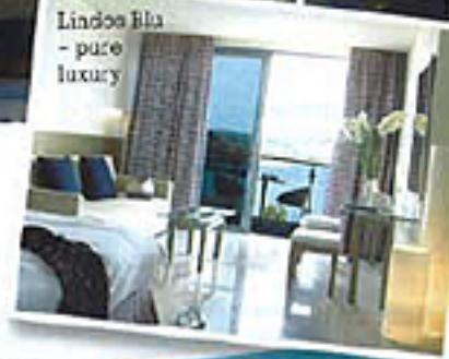
Lindos Blu – pure luxury