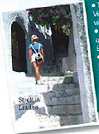
Stroll in Lindos