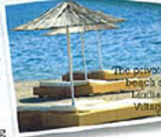
The private beach at Lindian Village

should also come near the top of your itinerary. If you're in need of a culture fix, take a stroll along the Street of the Knights to the Palace of the Grand Masters (a restored museum) and climb the clock tower for £3, trading your ticket in for a cocktail on the way down.